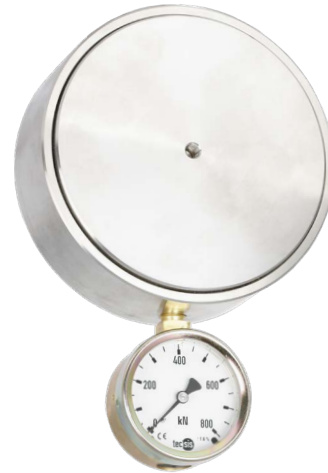
Hydraulic compression force transducer, model F1145