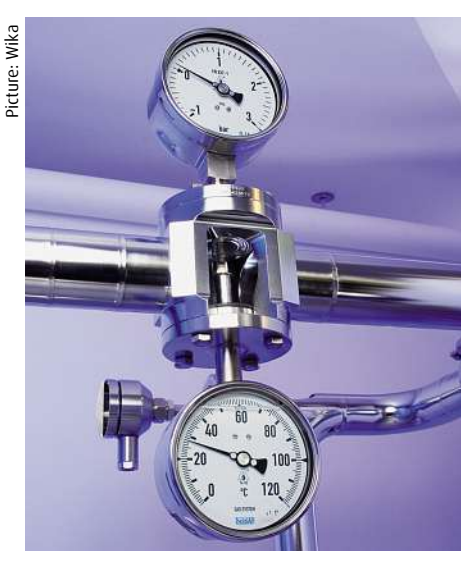
In sanitary applications it is important to make sure that the fill fluid behind the diaphragm is compatible with the process fluid, in case the diaphragm is damaged.

A diaphragm seal between the pressure gauge or sensor eliminates dead space and allows the vessel or pipe to be sterilized without damaging the measuring element.