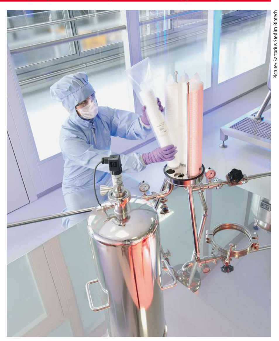
One of the applications for pressure sensors with in-line diaphragms: measuring pressure drop across cartridge filters.

The author is product manager Diaphragm Seals, WIKA Alexander Wiegand, Klingenberg/Germany. Contact: Phone +49(0)9372/132-9945